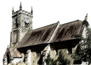
St Paul and St Margaret Nidd