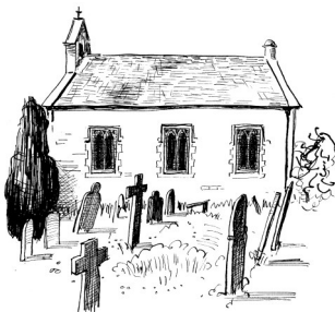
St. John the Baptist Brearton