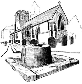
St. Mary the Virgin Goldsborough