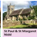
St Paul & St Margaret Nidd